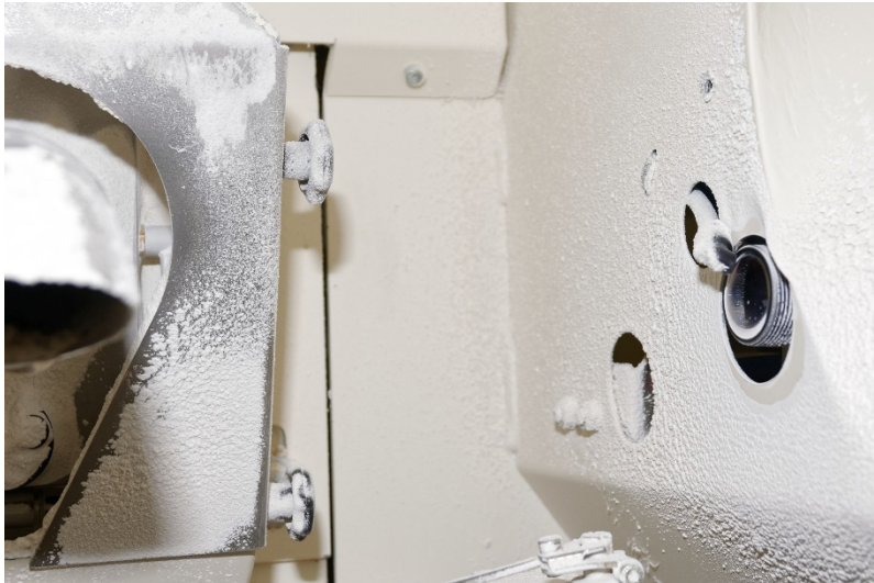
ipf electronic_Farbsensor_Weizen_Roggen-Mühle_003.jpg: Front side of the OF650180 color sensor with a blow-off device to remove flour dust from the optics.