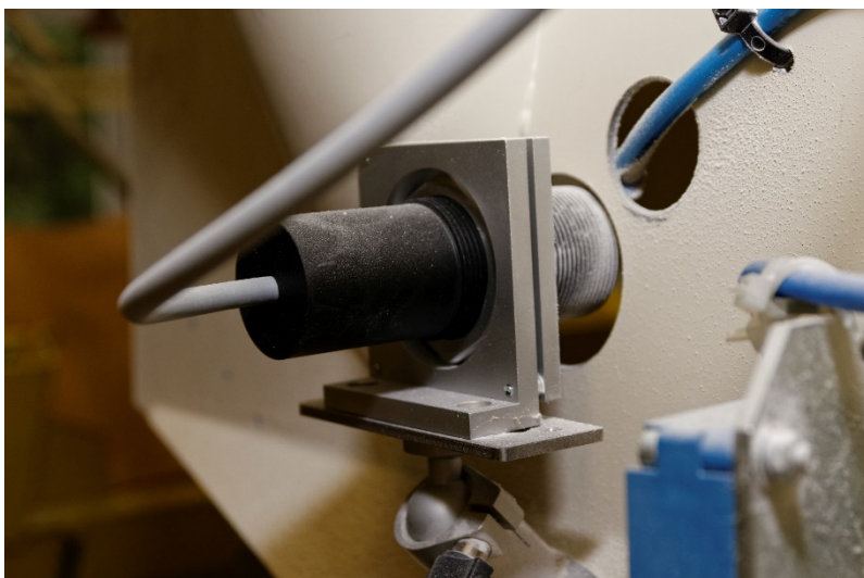
ipf electronic_Farbsensor_Weizen_Roggen-Mühle_004.jpg: Rear view of the application: An opening was created on a side wall of the automated filling line for the color sensor.