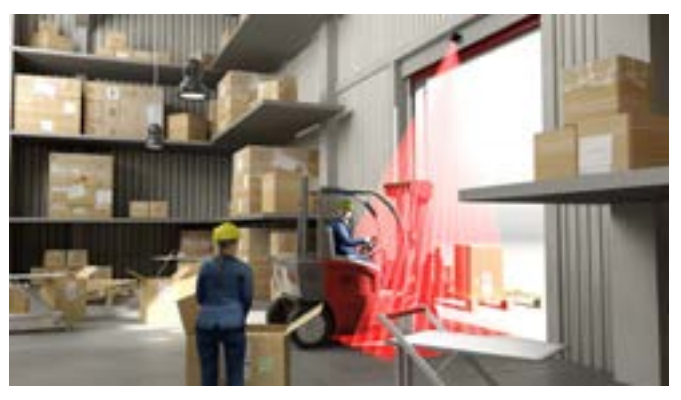
If a vehicle stops in the door area, the presence check of the sensor ensures that the door remains open until the vehicle leaves the detection range of the RO710900 . Vehicles that merely drive past the gate or persons moving within the detection range of the radar sensor are reliably blanked out.

Vehicles that merely drive past the door or people moving within the detection range of the radar sensor are reliably blanked out- the door remains closed. Since the new system only opens the door when it is really necessary, the company has also been able to achieve energy savings in heating the hall, especially in the cold seasons.