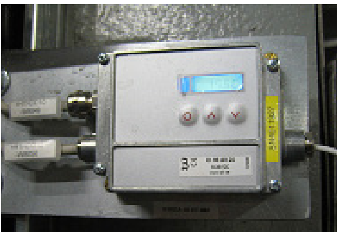
ipf_FHW_Neukoelln006: The separate evaluation unit is connected to the sensor via a cable and integrates an illuminated LCD display with easily accessible buttons for programming.