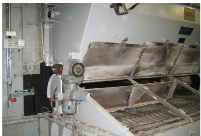
ipf_FHW_Neukoelln002: The infrared sensors and separate evaluation units were installed on the sides of the wandering grate (at left in photo).