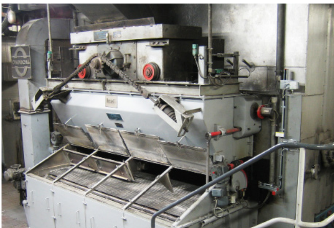
ipf_FHW_Neukoelln001: The feed hopper for the fuel is located directly in front of the heating boiler (in background) above the wandering grate.

If, for example, the preset temperature values were now exceeded in low-load operation, the employees have already been alerted through the prewarnings and can initiate appropriate countermeasures. Karsten Schliwa describes what such measures could entail: „In the event of a warning message and, thus, an imminent burn-back into the feed hopper, we can, e.g., increase the speed of the traveling grate. The glowing embers from the fuel, which may have already made it to the hopper, are thereby drawn back into the heating boiler. As a result, we can now effectively prevent upward burning into the hopper and, in the future, avoid possible consequential damages caused by a burn-back.“