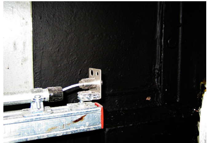
ipf_FHW_Neukoelln004 and ipf_FHW_Neukoelln005: Close-up of the measuring head, which was fastened to an aluminum profile in the front area and can be used in ambient temperatures of up to +180°C without cooling.