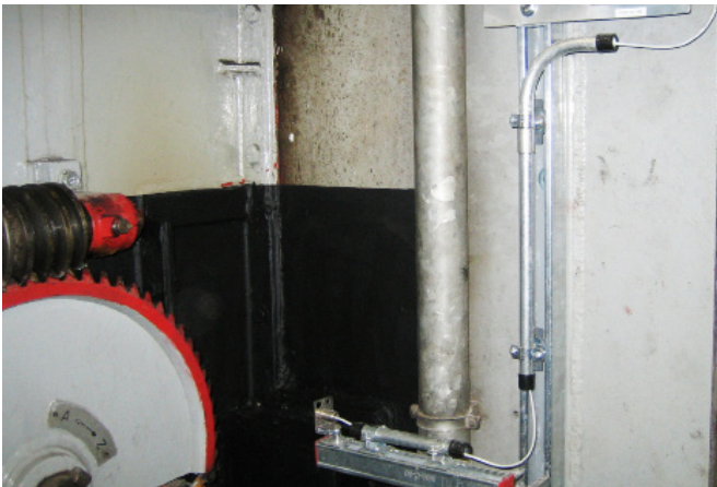
ipf_FHW_Neukoelln003: The infrared measuring head of the OI98A920 sensor system with degree of protection IP65, which is fastened to a profile, is among the smallest in the world (at bottom center of photo) and contactlessly detects the temperature on the walls of the feed hopper at FHW Neukölln at a distance of 300mm with a resolution of 22:1.