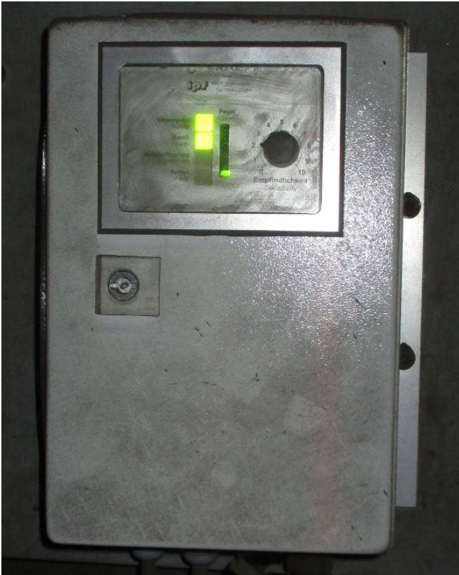
The response behavior of the detector coil can be set via the evaluation unit.