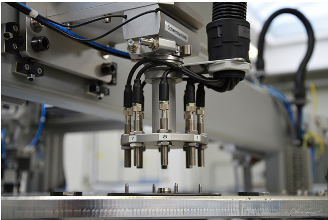
The test station has a total of eight sensors, alternating one MC080180 and MC080185 for the recognition of south and north pole respectively.

From Christian Diwald’s perspective, the result of collaboration with ipf electronic is very positive. „With the unipolar magnetic sensors, we can realize a very economical and yet compact test station, which makes a significant contribution to the process safety of our system.”