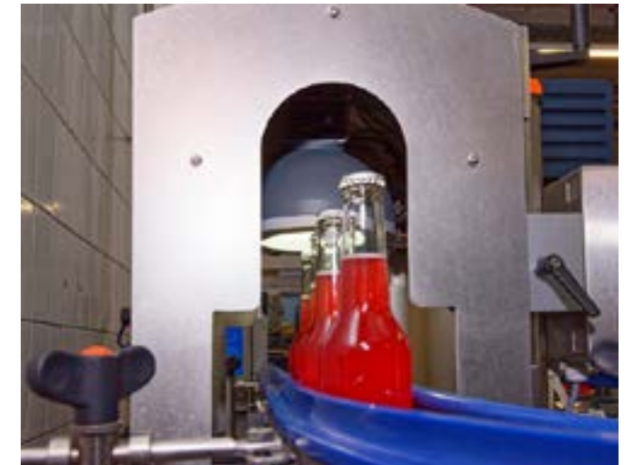
The OC539420 camera sensor detects crown corks of about six bottles per second vertically from above. The device is triggered by a customer's light barrier. Below the sensor, the dome light can be seen, which provides a diffused, shadow-free light.

In spring 2017, Peter Herres Wein- und Sektkellerei put the ipf electronic system into operation, with consistently positive experiences so far. „The camera system works perfectly, detects 100% of all bottle caps and reliably detects all faulty ones, no matter which product is being bottled on the system,“ says Timo Hennen, who has also recognized the potential of the OC53 for other areas of application in the company. "We now use the camera sensors to check barcodes on packaging cartons. Elsewhere, we use the feature check „edge contour“ of an OC53 to control the presence of threads in screw caps."