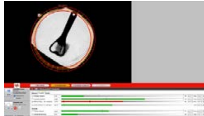
In addition to the position of the cap on the bottle, the crown cork is checked by means of a predefined difference value. In this case, the distances from the longest and shortest search beam are compared with each other. From this, the difference is formed, which virtually marks the measure of ovality of the closure.

However, if the OC539420 detects a contour distance over all search beams, an additional check of the crown cork takes place based on a predefined difference value. Here, the distances from the longest and shortest search beam are compared and the difference is generated.