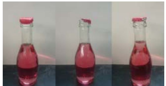
For preliminary tests provided bottles with defective crown corks. On the far right is a faulty closure, which is hardly recognizable neither from above nor from the side, depending on the position of the inspection system.

ipf electronic received some bottle samples with faulty closures for detailed preliminary tests (Fig. 1-3), which ultimately resulted in an OC53 camera sensor as the optimal solution for the task. This range contains around 40 different contour-based compact units with focal lengths of 10mm, 12mm and 16mm and operating distances from 50mm to 300mm as well as solutions with C-mount lens mount. In addition, the camera sensors differ among other things in terms of number and choice of feature checks, color or grayscale detection, speed and interfaces.