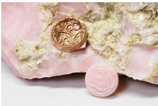
The special machine enables extremely intricate patterns and shapes, as shown in this and the following image: a rose made of opal