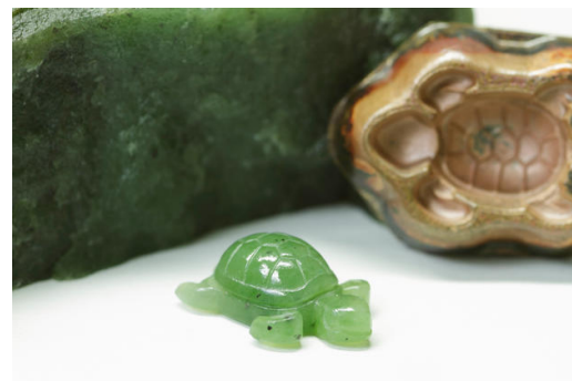
a turtle made of jade.