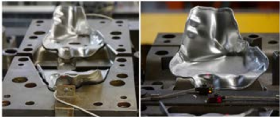
High process reliability: Optical sensors integrated in various stations of the progressive tool ensure that the respective plates are available for processing.

Another decisive plus point for the applications at Federal-Mogul Sealing Systems is the comparatively large and, if required, dynamically adjustable scanning range of the optical sensor (maximum range 60mm), which means that the solution can be used very flexibly for a wide variety of queries. In this specific application, a switching distance of around 30mm is mostly used. Depending on how fast the respective feed rate is set for processing or at which cycle rate the punching machine runs, smaller waves sometimes occur in the strip during further transport, which increases its distance to the sensor. The sensor can compensate for this due to the large adjustment range with exact adjustability of the end reach, whereby the scanning range or reach of the OTQ90170 is ideally set so that it ends a quick distance before the upper tool.