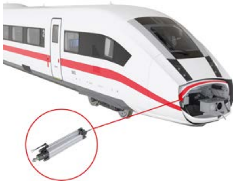
Coupling system of a railcar aerodynamically clad by GRP half shells, which can be opened via pneumatic cylinders. The task: To ensure that the cylinder position is always reliably sensed under extremely harsh operating conditions.

The coupling system of the railcars of high-speed trains is aerodynamically clad by GRP half-shells which can be opened via pneumatic cylinders for access to the coupling. The position of the cylinders (extended or retracted) must be monitored, because when the half-shells are open, the maximum permissible speed of the railcar is limited for safety reasons. Because the GRP half shells do not hermetically seal the coupling system, the pneumatic cylinders are subject to extremely harsh operating conditions under all conceivable environmental influences. The challenges: an operating temperature range of -40°C to +80°C, extreme mechanical vibrations, strong weather fluctuations (change of high and low temperatures, icing), dirt, dust, humidity, etc.. In addition, the mounting grooves of the pneumatic cylinders are only accessible from above.