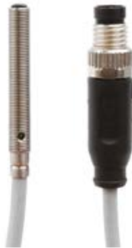
Only 5mm is the diameter of the OT059170 energetic diffuse-reflection sensor, which also has an IO-Link interface.

Energetic diffuse-reflection sensors occupy a special position among optical sensors, since they operate according to the principle of intensity distinction. The diffuse-reflection sensor have a fixed switching threshold in relation to the specific amount of light detected (sensitivity). If the amount of light (intensity) reflected by an object reaches or exceeds this threshold, the signal output switches. If these conditions are not met, the sensor does not generate a switching signal. Energetic diffuse-reflection sensor thus reliably detect all objects that reflect sufficient light or enough light to exceed the internal switching threshold. With a length of 36mm and a diameter of 5mm, the OT059170 is the smallest energetic diffuse-reflection sensor in ipf electronic's portfolio.