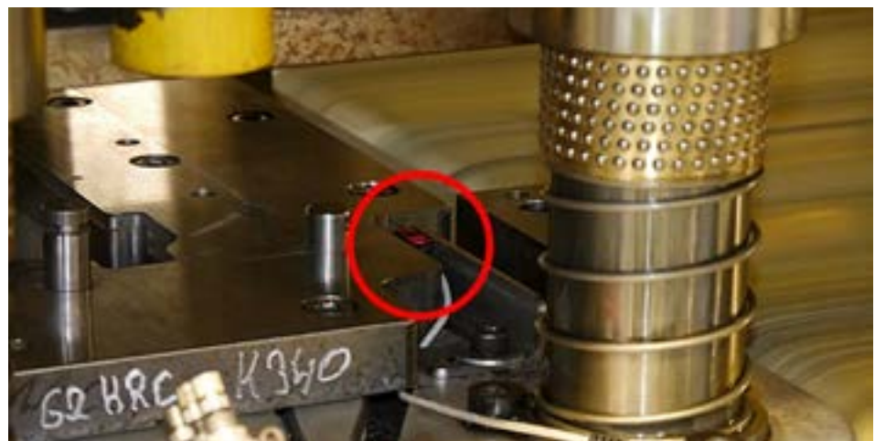
Due to its dimensions, the OTQ90170 can be installed directly in the progressive dies of the MLS stamping plant for feed rate control.

With regard to the application as described, the diffuse-reflection sensor was able to convince in several respects as an economical solution to the costly forked light barriers: through its extremely compact design, its background suppression, its dynamically adjustable scanning range and the high switching frequency and low response time. All together these features gave a lot of potential for flexible applications in the MSL stamping plant. Due to its dimensions of just 9.2x10.8x21.2mm, the OTQ90170 can be installed directly in the progressive dies. The devices are already preset for the respective applications in the stamping plant of Federal-Mogul Sealing Systems. It is also possible to teach the sensor externally via a teach box.