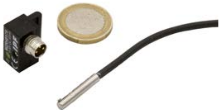
Small, compact and technologically sophisticated: the MZR40178 (center) and MZR40175 cylinder sensors.

However, such materials are subject to aging processes under certain environmental influences and become brittle, for example, which significantly shortens the durability of the sensor. Particularly harsh or aggressive environmental conditions can affect the plastic of the housing even more, possibly making it soft or hard or extremely brittle and fragile. In addition, such cylinder sensors made of plastic can only be fastened with a comparatively low torque, as otherwise the thread of the grub screw is destroyed during installation. There are attempts to solve this problem with metal inserts. However, these can break out, for example, as the plastic becomes increasingly brittle due to external influences. The MZR40178 and MZR40175 cylinder sensors in metal housings, however, are subject to virtually no wear and are designed for ambient temperatures of -25°C to +70°C, for example.