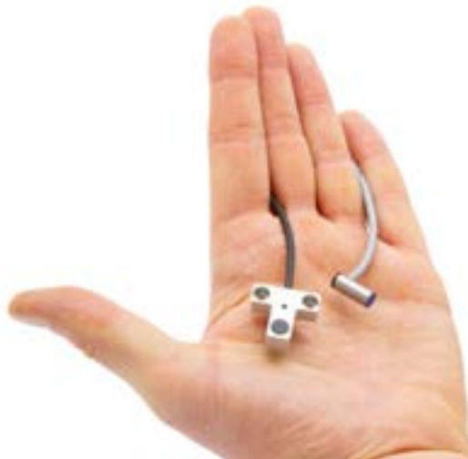
The IB06A023 (right) and IB98E314 , which belong to the special devices, are among the compact solutions for inductive sensors.

Inductive sensors detect all conductive metals at short distances, while other materials do not affect their switching behavior. The devices are extremely robust and are therefore suitable for extremely harsh operating conditions and environments with very high dirt loads in almost any type. With a diameter of 6.5mm and a length of 16mm, the IB06A023 in cylindrical design is one of the compact solutions among inductive proximity switches. The device design with lateral cable entry on the stainless steel housing is striking. The sensor in protection class IP67, which belongs to the special devices, achieves a maximum switching distance of 1.5mm. As a special design, ipf electronic also developed the cuboid-shaped IB98E314 (switching distance 2mm) with an overall height of only 9.5mm (length 24.5mm, width 23mm), which can be mounted in the aluminum housing via two lateral holes.