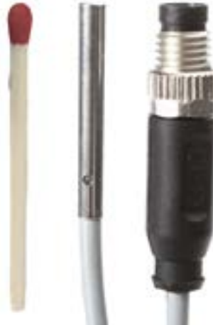
The IOR40176 is just the size of a match head with a diameter of only 4mm.

has an extended switching distance of 3mm. Even with different metals (e.g. aluminum or steel), the IOR40176 achieves the same maximum ranges. In this context, for the sake of completeness, a quick explanation of the functionalities of inductive sensors should be given.