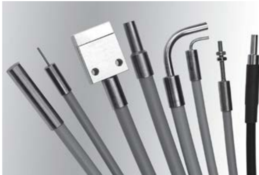
Optical fibers with different diffuse-reflection sensor.

Fiber optic sensors are basically differentiated by the fiber optics. Glass fiber optics consist of a bundle of ultra-thin glass fibers, while plastic fiber optics consist of extremely thin plastic fibers. The ends of the light guides, known as front ends, facilitate installation and have diffuse-reflection sensors for additional optics. The diffuse-reflection sensor are available in various designs, including e.g. angled diffuse-reflection sensor.